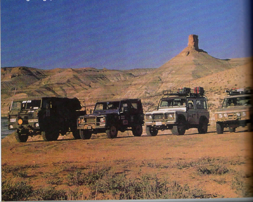
Lined up for a quick photo-call at Flaming Gorge, northern Utah

The first day took the expedition through the Kooteni National Forest, heading south through the mountainous shores of Lake Koocanusa, to Libby Dam. The group was then split into three groups of